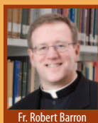
Fr. Robert Barron

Francis Cardinal George, O.M.I. Archbishop of Chicago