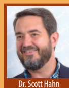
Dr. Scott Hahn