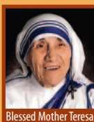
Blessed Mother Teresa