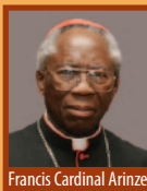
Francis Cardinal Arinze