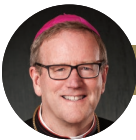
BISHOP ROBERT BARRON

Offer valid for US customers only. Free shipping available only in Continental US. To qualify for free shipping, place orders separately from other Augustine Institute products.