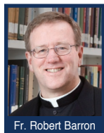
Fr. Robert Barron