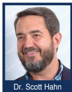
Dr. Scott Hahn